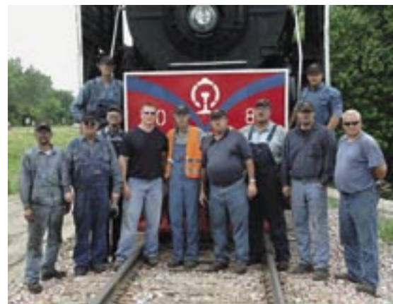
Staff and crew of the Iowa Interstate Railroad pose at Booneville with one of the line's 'newest' items of rolling stock. Iowa Interstate boss Henry Posner III is wearing the high-vis vest.