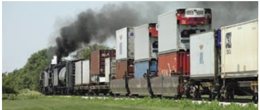
Above: There's not much that can dwarf a 'QJ' but a double-stack container wagon has a good go!

is divided into two sections. The area in which we were standing was a store for motor vehicles and other railroad equipment. When we reached the end of this section, Adam operated the roller shutter door to reveal the massive front end of No 7081, with No. 6988 behind.