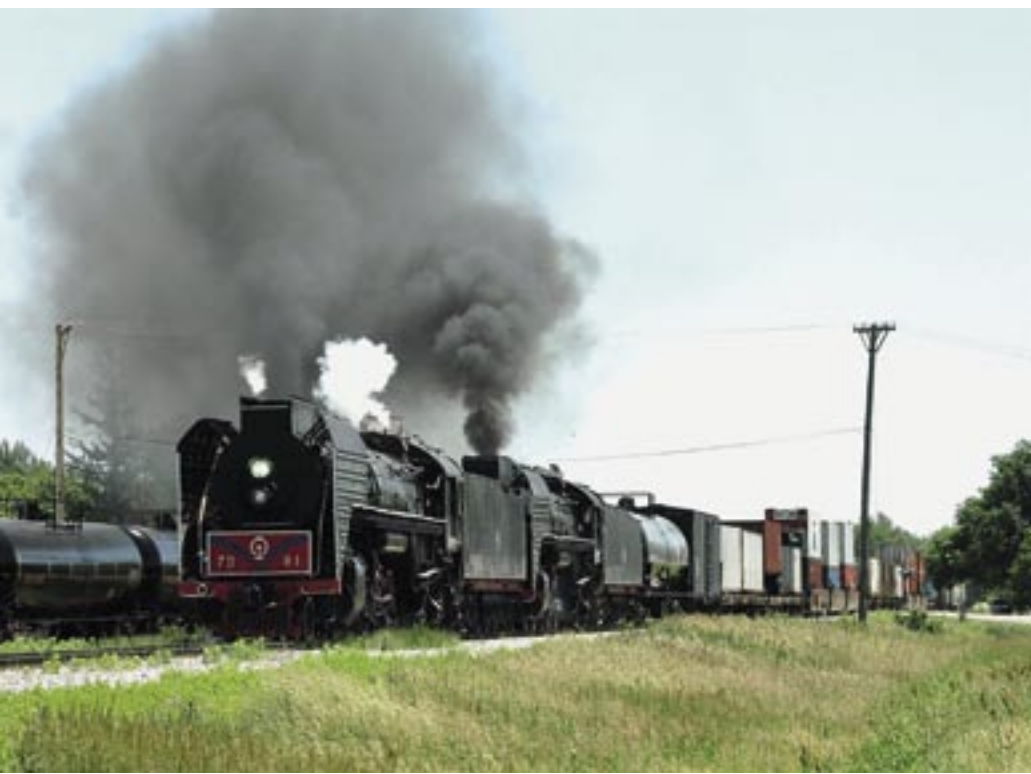
Above: Proper working steam, USA-style! 'QJs' Nos. 7081 and 6988 pass Menlo, Iowa, at speed on June 9.