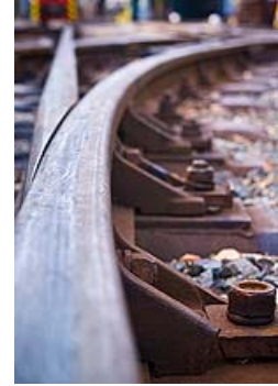
China proposed to build a rail alternative to the Panama Canal in Colombia

China is looking for raw materials everywhere in the world. The Chinese demand is driving expansion of coal industries in Australia, Mozambique and obviously also in Colombia. What is constraining the ability of coal to get to China is quite often missing rail capacity. In this case, it seems to me that China is proactively getting involved in rail transportation in anticipation of problems getting the coal to the market.