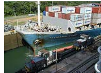
Rail is not seen as a competitor to the Panama Canal as rail freight is more expensive and complex than the waterway.

If you really believe that the Panama Canal is somehow going to need an alternative than I think the best option would be to update and extend the existing Panama railroad, not building a brand new railroad across mountainous territory at an astronomical cost.