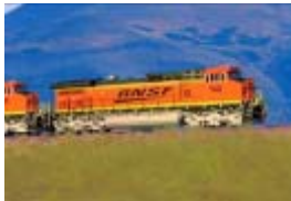
Burlington Northern: Big bet for Buffett

Warren Buffett's Berkshire Hathaway is to acquire Burlington Northern Santa Fe (BN) for $34 billion in cash and stock, marking the biggest deal in the history of the North American railroad sector and the largest acquisition in Berkshire history.